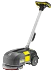
BD 30/4 C BP